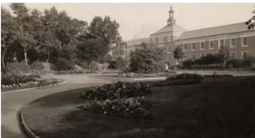
The Municipal Buildings, Gillingham; DE402/21/40

For example, although the strong rooms were built by the Liverpool Artificial Stone Co., Rotherhithe, the strong rooms doors came from the Ratner Safe Co. of Bromley. Other firms provided the polished ancaster pavings and wall linings, iron monger, sanitary fittings and electrical fittings, to name but a few of the thousand and one items required in the fitting out process.