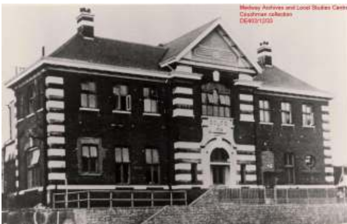
Rochester Bridge Station

began to rationalize services and layouts. High on the list was the matter of the Chatham Central Branch. This was eventually closed on 30th September 1911, though not before the citizens of Rochester had negotiated some local improvements, including the rebuilding of Rochester Station with two additional platforms, and the provision of a footbridge across the goods yard in Blue Boar Lane to improve access to Blue Boar Pier. With the closure of the branch came a rearrangement of the track layout across the two bridges over the Medway, the Victoria/North Kent line junction being moved to the east bank. From then on, trains bound for Victoria used the LCDR bridge while those for the North Kent Line used the old SER bridge. The track and signalling layout for this work is held at Medway Archives and Local Studies Centre.