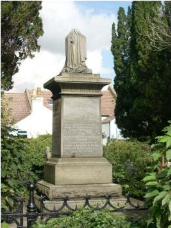
Foord Family Memorial, St Nicholas Cemetery, Rochester