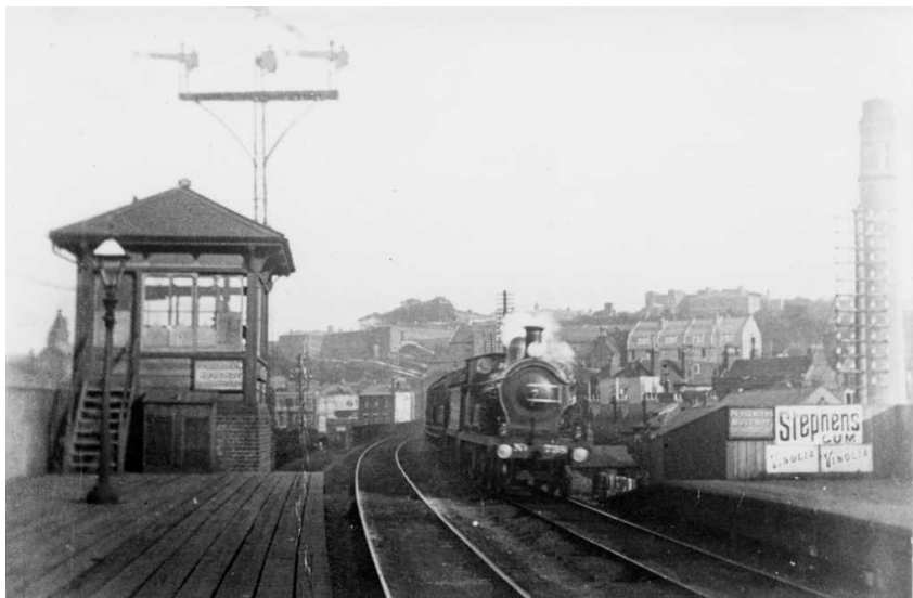
SECR number 738 entering Rochester Station; Medway Archives and Local Studies Centre.