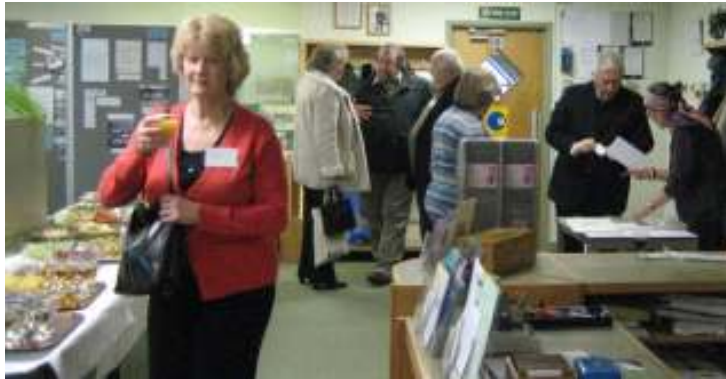
Guests start arriving.