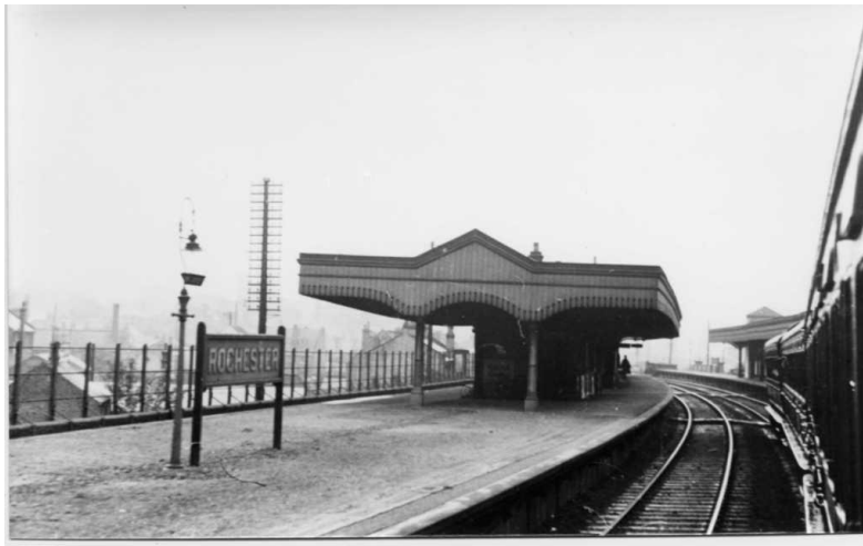
Rochester Station, Rochester High Street