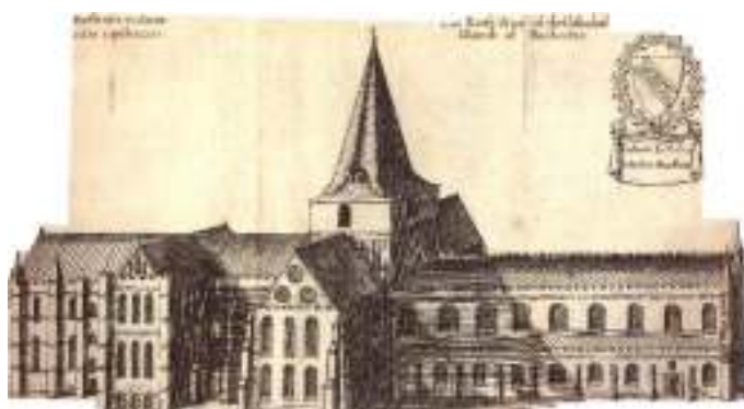
Rochester Cathedral in the 1780s