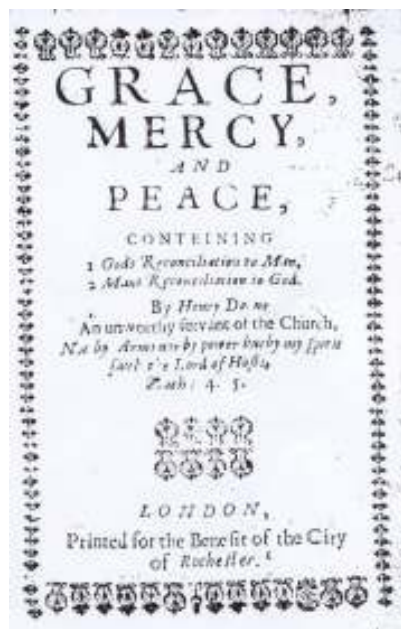
Grace, Mercy and Peace; Early English Books Online