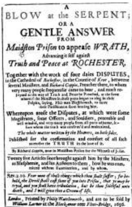
A pamphlet published at the time of the dispute